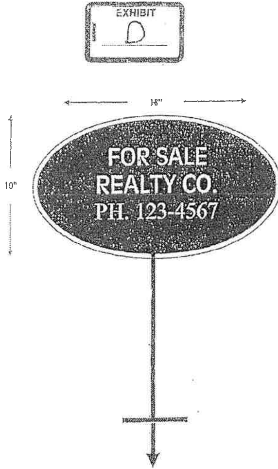
18" x 10" Wood or Metal sign (Dark Green Background w/White Letters and Border) mounted to metal stop stake